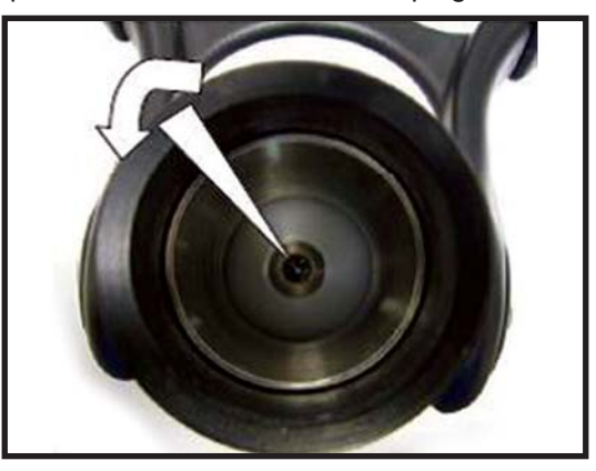
Step 19) Included with the kit is a new o-ring to seal the coupling to valve body connection. Lightly grease this o-ring. Install this o-ring on the valve body as shown. Also, lightly grease the ball ring groove on the valve body.

Step 18) With the valve handle held in the closed position, using the 3/16" Allen wrench back the valve plug out (unscrew) unit it makes firm contact with the slider. Once contact is made with the slider, open the valve handle part way and unscrew the valve plug 10 degrees. This will set the proper tension between the valve plug and slider.