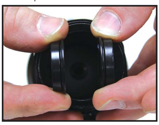
Step 14) Lightly grease the outside circumference of the slider with the grease provided in the kit. Install the slider with the chamfered edge facing the valve plug. Use caution when installing the slider that it does not pull the valve discs out of place. Push the slider in until it contacts the valve plug then pull back about 3/8".

Step 13) Place one valve disc in each side of the valve body from the inside of the valve. Orient the discs as indicated in the photo.