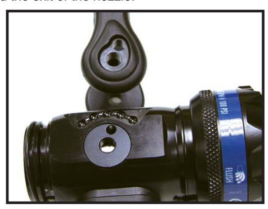
Step 17) Install a cam pin in each cam pin hole. Insure it seats in the groove in the slider. The cam pin face should be flush with the surrounding handle when properly installed. Apply red Loctite® to the threads of the button head screws that retain the handle. Install one on each side of the handle until hand tight.

Step 16) Install the detent springs and balls back into the bail handle. Using the same method as when the handle was removed retain the springs and balls in the handle with your thumbs. Install the handle over the valve snapping it into place. Insure that the valve handle is oriented as indicated in the photo. The cam pin hole should be forward toward the exit of the nozzle.