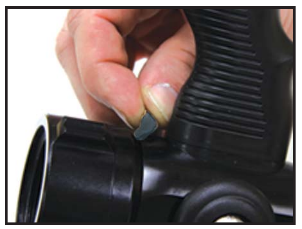
Step 23) With the valve in the closed position pour a cup of water into the valve. Check to insure no water leaks through. If it does the valve plug likely needs to be backed out a little further.

Step 22) Lightly grease the port plug then press back into the valve body. If you have difficulty installing the port plug a ball bearing may be obstructing the path of the port plug. Using your pointed pick insure the balls are pushed to either side of the port plug path. Insure the port plug is fully seated and flush with the valve body.