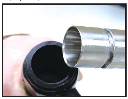
Step 15) Align the cam pin hole in the valve disc with the groove in the slider. Insure that the cam pin hole is facing up nearest the valve detent arc.