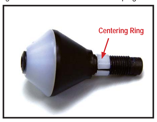
Step 11) Thread the new valve plug into the valve body until snug. DO NOT tighten.

Step 10) If the old valve plug has a black centering ring, remove the black ring from the old plug and remove the white ring from the new plug, place the black ring on to the new plug. Otherwise, the valve plug can be used as provided. Using the grease provided in the kit apply a light coat of grease to the threads of the valve plug.