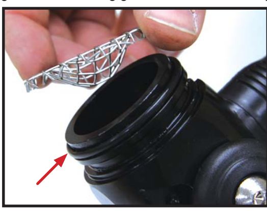
Step 20) Install the debris screen over the valve body so the concave portion faces down over the valve body. Next, lightly and evenly press the coupling down onto the valve body. Pay close attention that the o-ring does not get pushed out of place or pinched.