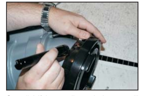
Step #2) If the coupling swivels, rotate till the end on the polymer ring can be seen through the access port. The ring can also be moved with the seal pick if required.

If the coupling does not rotate, it is locked out with a stainless steel ball (Photo #9). The end of the polymer ring will be in position for removal.