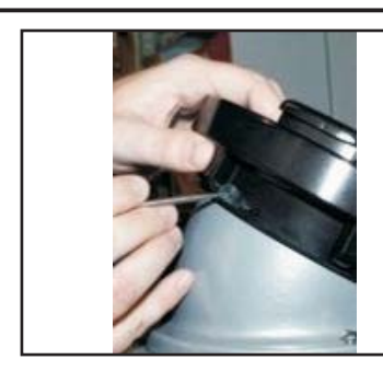
Step #1) Using the seal pick or pointed pin, remove the port plug or port cover, which is used to cover the access port to the polymer ring.

Items required: Replacement coupling, port plug or port cover, Dow 112 grease, pointed pin/seal pick, pliers, polymer strip removal tool THA401, cup seal, 7/32" allen wrench, Loctite® 242 and lockout ball. All items are supplied in our coupling replacement kits.