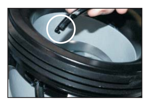
Step #10) Insert polymer ring into the port with the blunt end first. (Note: Hook end goes in last.) When inserting in a Storz coupling, spray

the polymer ring with BreakFree before assembly.