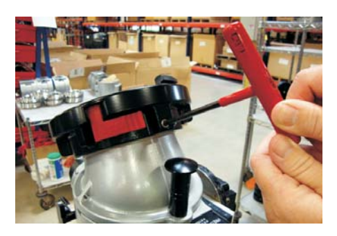
Step #9A) If a rigid/locked-out connection is desired. Push coupling onto unit. Align threaded hole in coupling with lock-out detail in unit. Apply Loctite® 242 to lock out screw. Thread screw into coupling until it touches the bottom of the lockout detail. Do not over tighten – this will result in leaks.