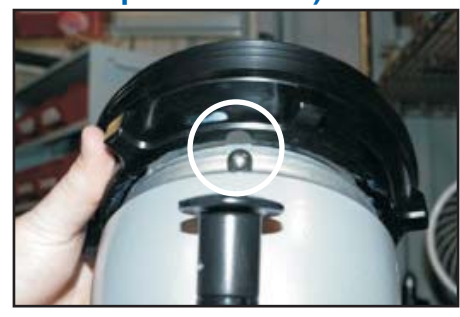
Step #9B) If desired, install lock out ball. Apply a small amount of grease to the ball pocket to help retain the ball in position. Push coupling on completely. If lock out ball is being used, note alignment.