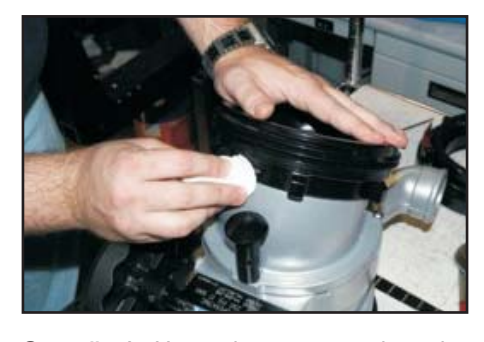
Step #12) Use a degreaser to clean the area of the port is the cover type is used. Use short end of the THA401 to assist in the installation of the port plug. Install till flush.