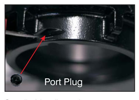
Step #13) Install port plug or port cover.