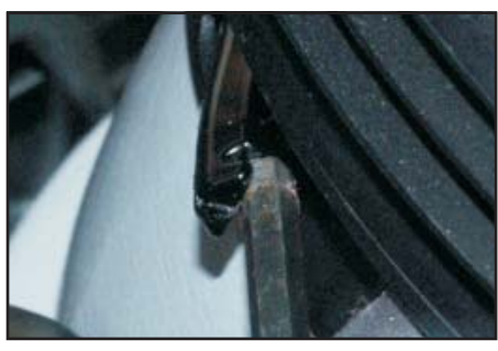
Step #11) Install polymer ring fully. The THA401 may be used to insert the strip the last 2 inches.