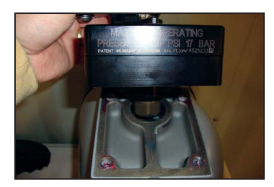
STEP 5) Install the gearbox with the positional indicator closest to the hose side coupling of the valve. Some adjustment of the valve ball may be needed in order to properly align the gearbox trunion with the mating socket of the valve ball.