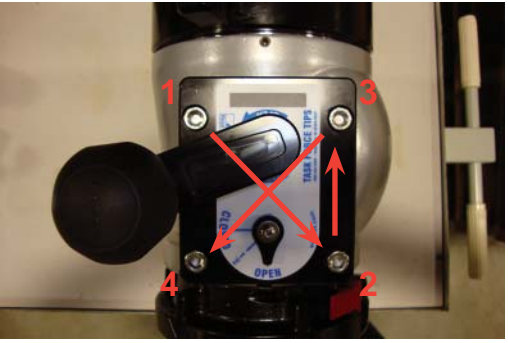
STEP 6) Apply Loc-tite® #271 to the first half inch of threads of the screws included with the kit. Install the four screws tightening them in a criss-cross pattern.