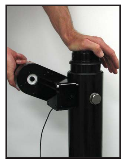
tube while turning knob.