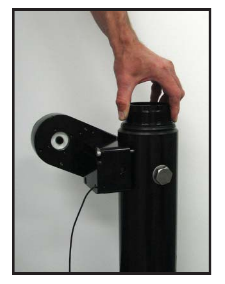
while in down position.

Verify that the tube latches in the fully extended and fully retracted positions and not in any intermittent positions. If intermittent latching occurs, remove the gearbox and check the orientation of the timing marks.