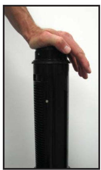
To test down latch, pull up on tube To release down latch, push down on To test up latch, push down on tube while in up position.