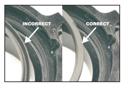
10) Grease cup seal, if used, with Dow 112 and install into coupling with sealing lips down (away from you).

Note: direction of sealing lips face down into coupling.