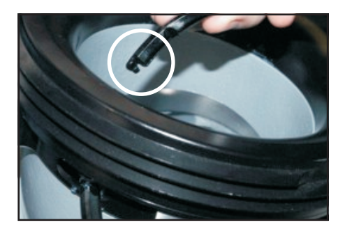
13) Push new plastic strip into port. Note: Hooked end goes in last.