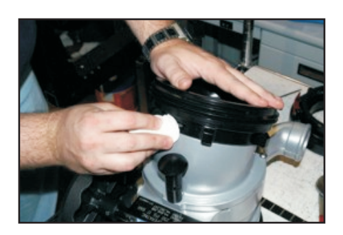
15) Clean dirt, debris, and grease off of coupling.

Use a T-handle Allen wrench to push the strip the rest of the way into the strip channel.