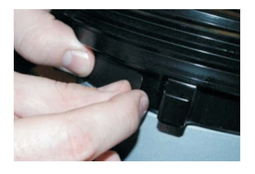
16) Install port plug or port cover.